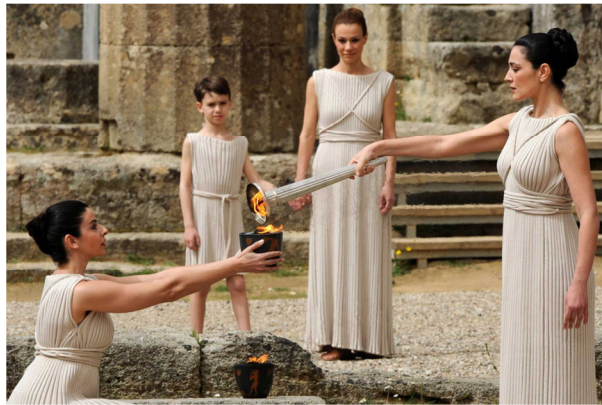
Ceremony of Olympic flame (Olympia)